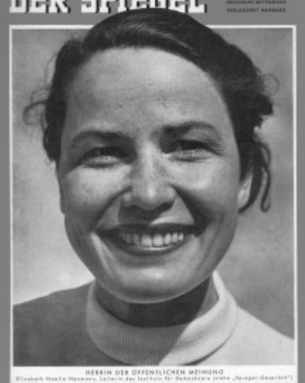
Elisabeth Noelle-Neumann auf dem Titel des Spiegel